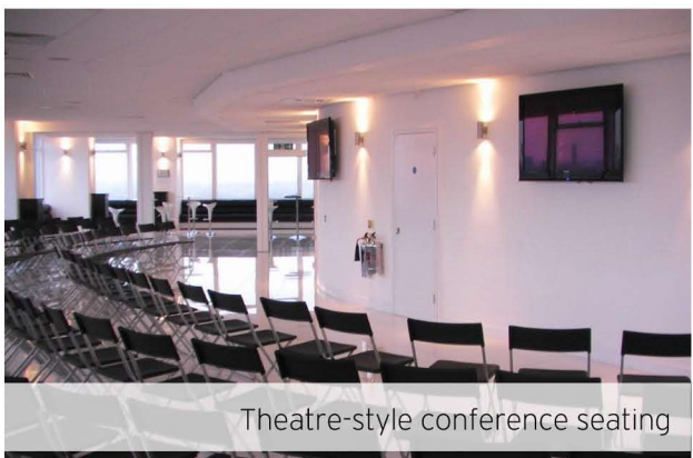
Theatre-style conference seating