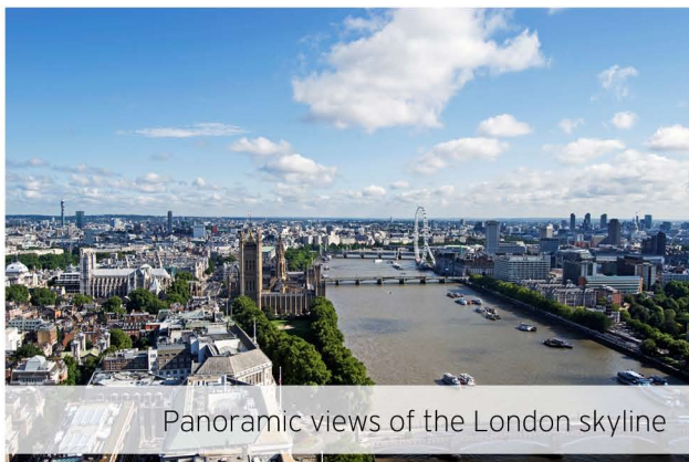
Panoramic views of the London skyline